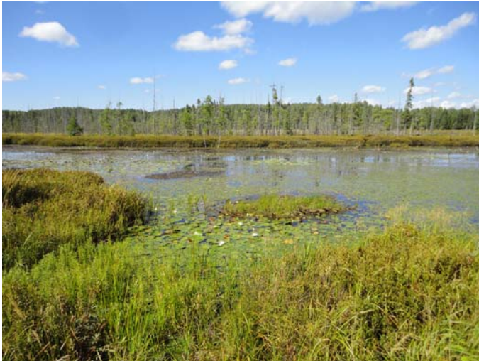
Submergent marsh and bog, Notre Dame Reserve.