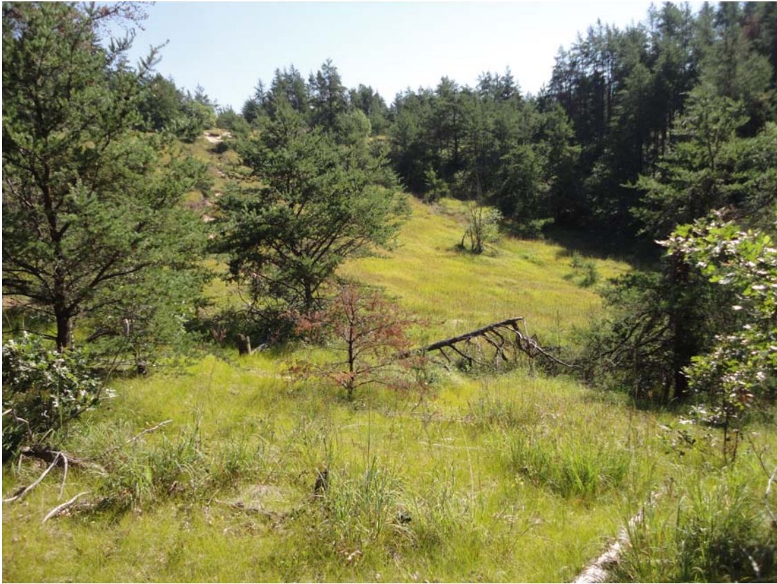
Pine barrens in a sinkhole (above) and bog (below), The Sinkholes (Sinkholes_Tomahawk_Barrens).