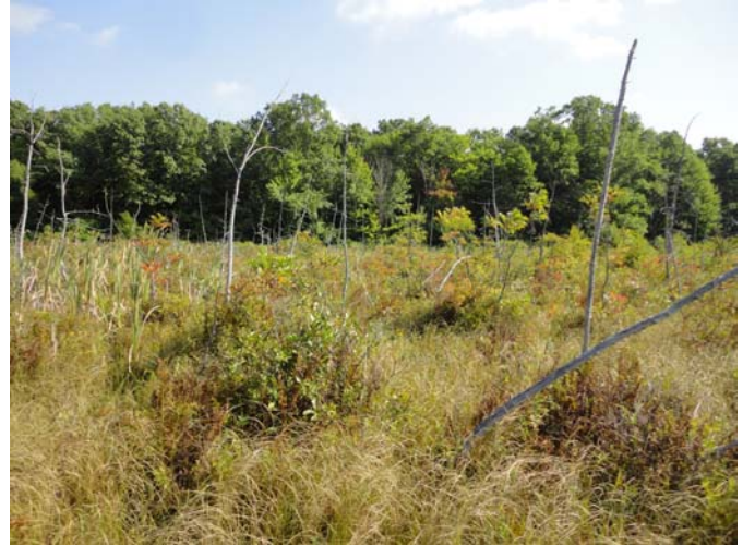
Poor fen, Pinckney Waterloo (Photo by Joshua Cohen).