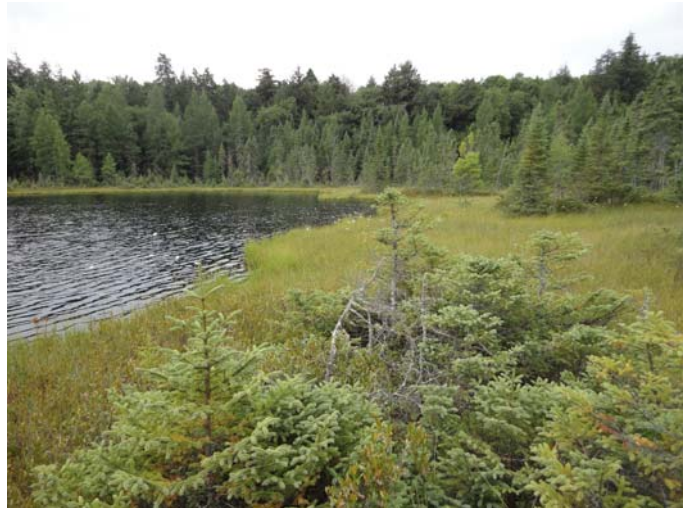
Bog, Sylvania.