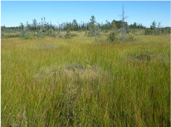
Patterned fen, Upper East Branch Fox River (Photo by Bradford Slaughter).