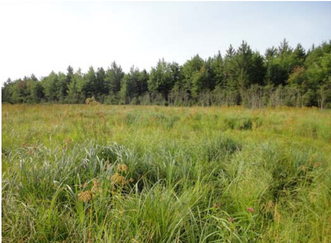
Northern wet meadow, Roscommon Compartment 98 (Photo by Joshua Cohen).

Conducted two days of surveys on State Forest land. Surveys focused on minerotrophic wetlands along Jordan River valley. Documented two high-quality rich conifer swamps, two northern fens, and a northern shrub thicket.