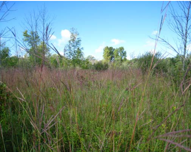
Wet-mesic prairie, Holly SRA.

Surveys were conducted to evaluate wetlands associated with drainage of Horseshoe Lake. Documented high-quality rich conifer swamp.