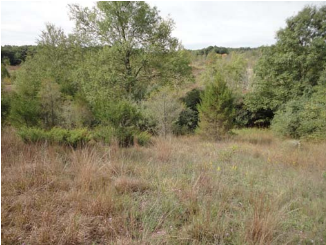
Dry sand prairie, Pinckney Waterloo.