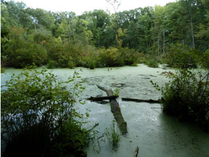
Inundated shrub swamp, Bald Mountain SRA.

Surveys were conducted to evaluate wetlands in Chamberlain Lakes unit and Trout Lake unit. Documented two high-quality inundated shrub swamps.