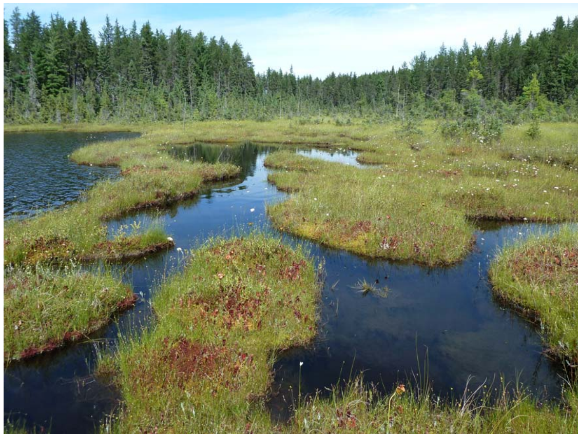
Bog, Murphy Creek Peatland (Sleeper Wetlands) (Photo by Bradford Slaughter).