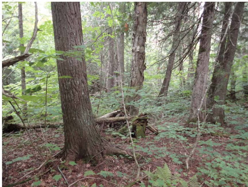
Hardwood-conifer swamp, Porcupine Mountains (IX.6).

Surveys on State Park land focused on wetlands associated with the Lake of the Clouds and the Big Carp River. Documented high-quality hardwood-conifer swamp.