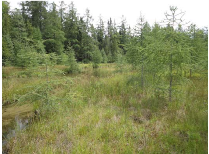
Northern fen, Jordan River Valley and Chestonia Highlands.