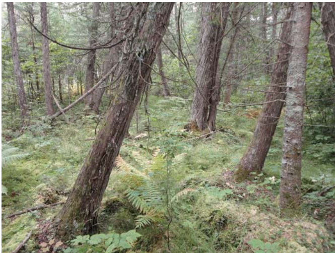
Rich conifer swamp, Deadstream Swamp.

Surveys focused on wetlands associated with North Eddy Creek on State Forest land. Documented high-quality rich conifer swamp.