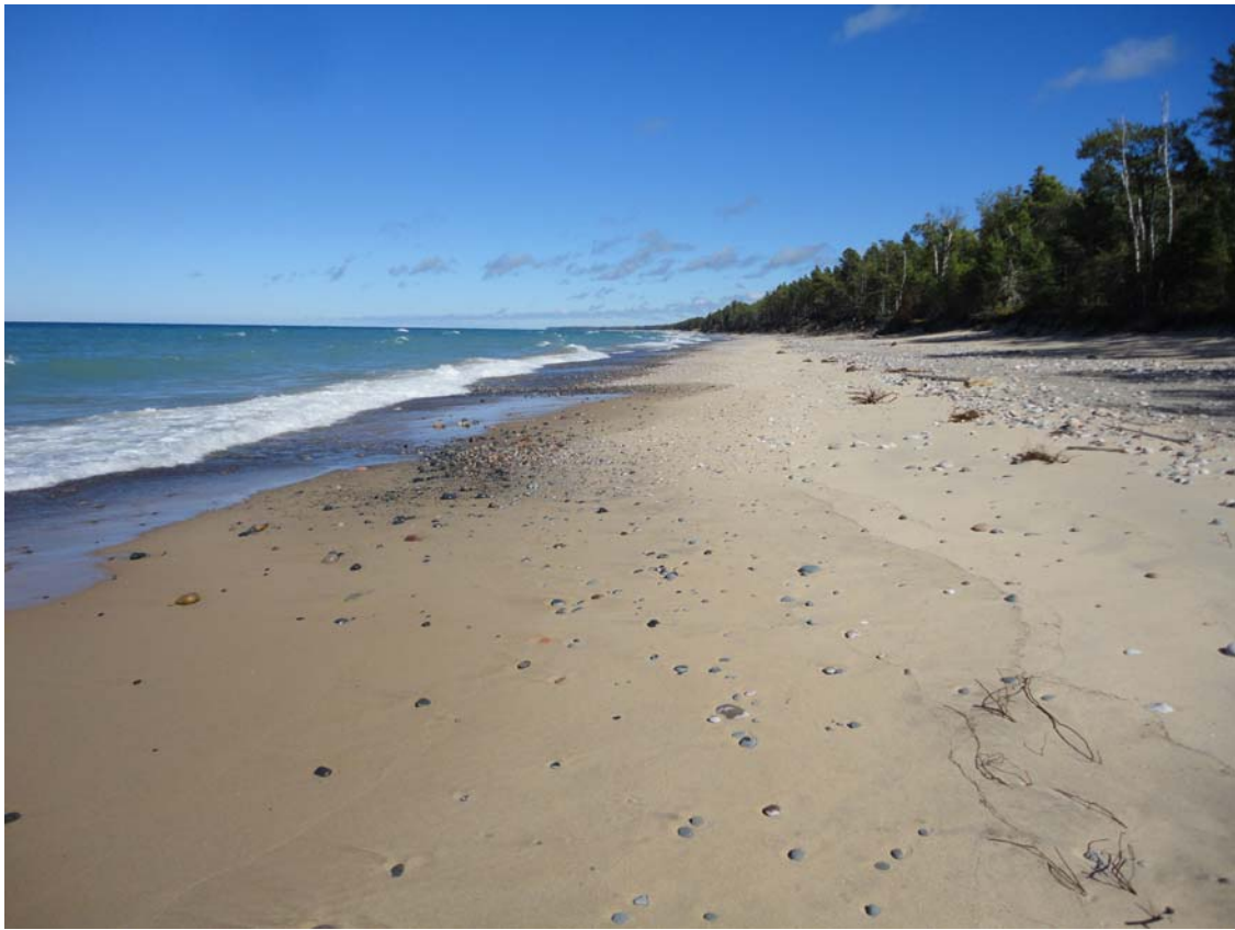
Sand and gravel beach, Lake Superior Beach #1 (Photo by Joshua Cohen).