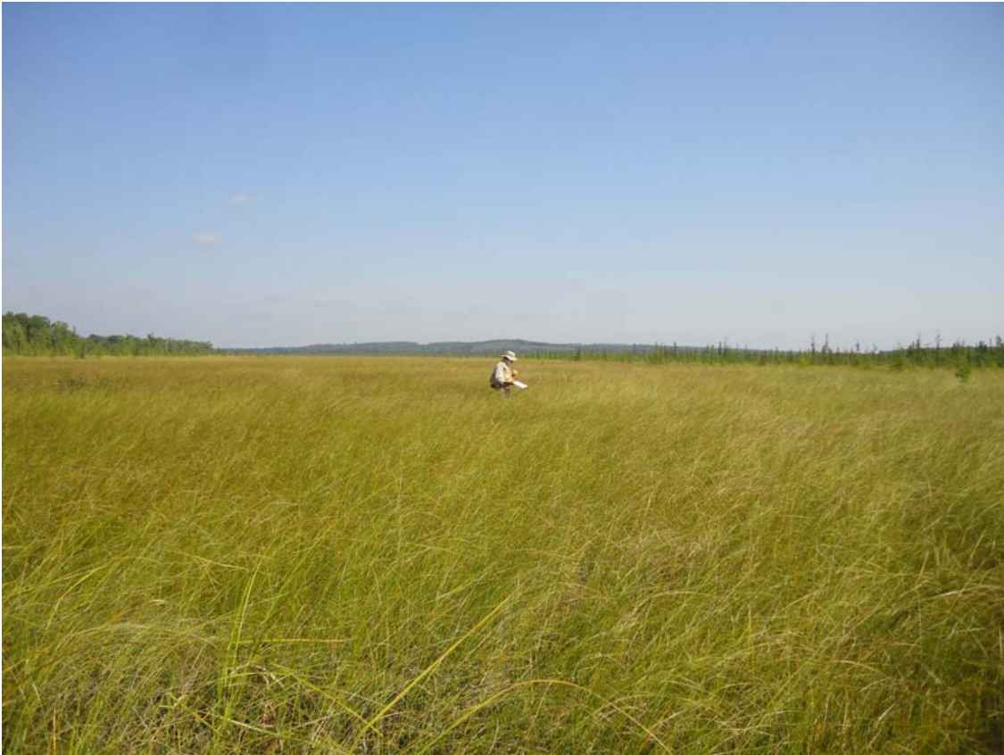
Poor fen (above) and northern wet meadow (below), Hudson Creek.