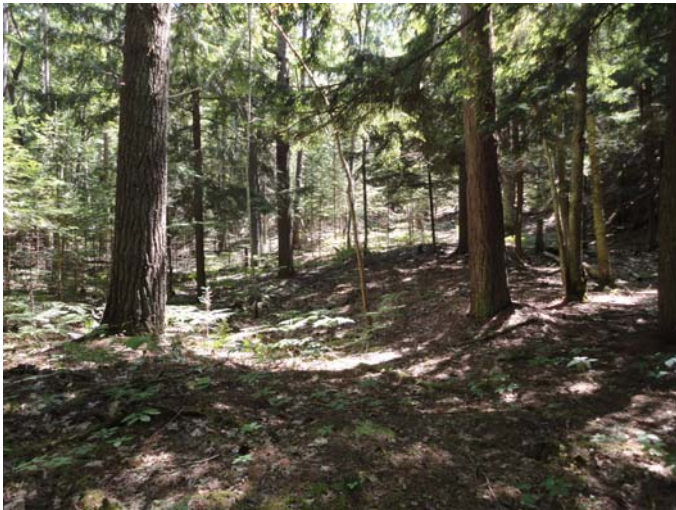
Dry-mesic northern forest, Wilderness State Park_Wycamp Complex.

Surveys focused on near shore area on State Forest land. Documented high-quality mesic northern forest, interdunal wetland, and dry-mesic northern forest. Also documented high-quality open dunes that will be incorporated into existing open dunes element occurrence.