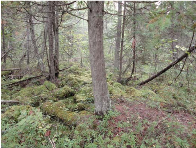
Rich conifer swamp, Smokey Hollow NFW.