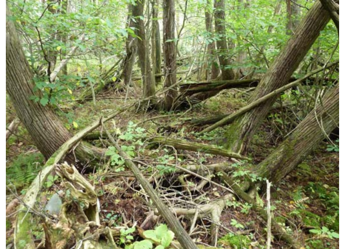
Rich conifer swamp, Flint River (Photo by Bradford Slaughter).