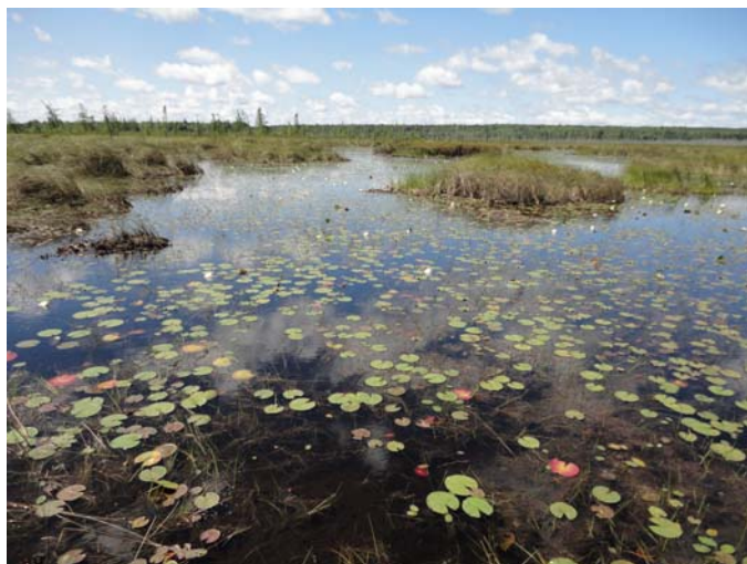
Submergent marsh, Pigeon River (Photo by Joshua Cohen).