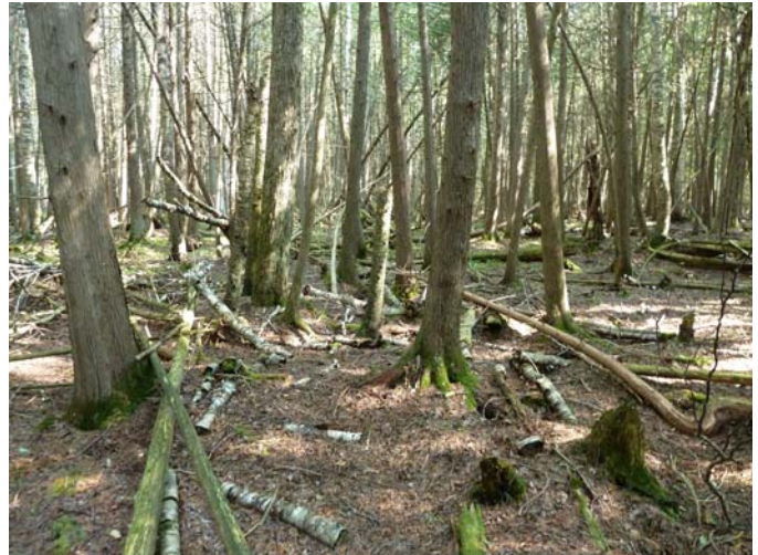
Degraded rich conifer swamp, Grayling Compartment 66.