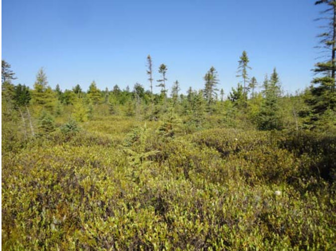
Muskeg, Black Forest NNFW.

Surveys focused on wetlands associated with Black River floodplain on State Forest land. Documented high-quality floodplain forest.