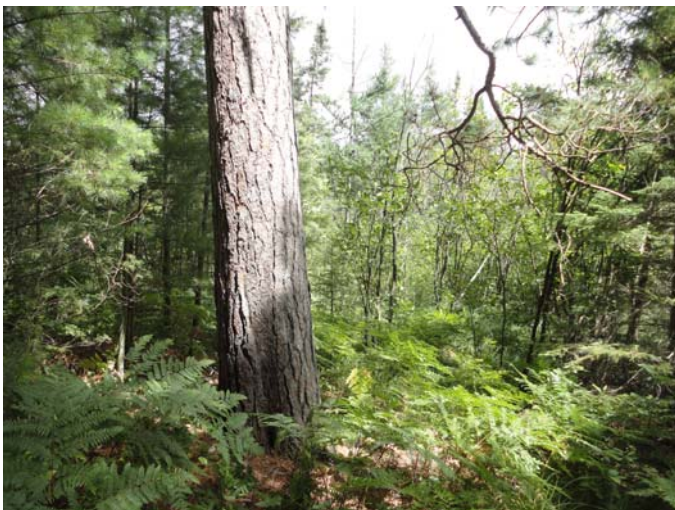
Dry-mesic northern forest, Tomahawk NFW (Photo by Joshua Cohen).

Surveys focused on wetlands associated with Lower Tomahawk Lake on State Forest land. Documented high-quality rich conifer swamp (possibly northern record of rich tamarack swamp), dry-mesic northern forest, northern wet meadow, muskeg, northern shrub thicket, and poor conifer swamp.