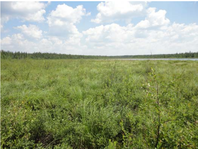
Northern wet meadow, Grayling Compartment 227 (Photo by Joshua Cohen).

Conducted two days of surveys on State Forest land. First day of survey focused on wetlands associated with Beaver Creek and Mud Lake. Documented high-quality rich conifer swamp, poor conifer swamp, muskeg (possible inclusion), northern shrub thicket, and northern wet meadow. Second day of survey focused on open uplands. Documented high-quality pine barrens.