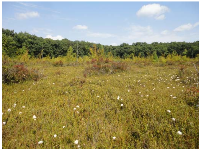
Bog, Pinckney Waterloo (Photo by Joshua Cohen).