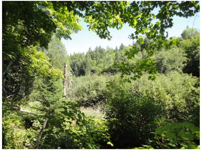
Northern shrub thicket, Duke-Rock-Fish Complex.