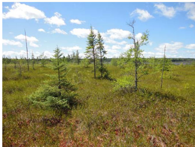
Muskeg, Pigeon River (Photo by Joshua Cohen).

Surveys focused on wetlands associated with Dog Lake on State Forest land. Documented high-quality bog, muskeg, poor fen, northern shrub thicket, and submergent marsh.