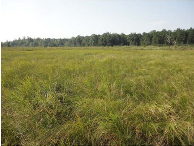
Northern wet meadow, Wolf Creek and Grass Lake (Photo by Joshua Cohen).