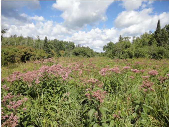
Northern wet meadow, Bates Lake NFW.

Surveys focused on wetlands and uplands associated with the Fence River. Documented high-quality rich conifer swamp, northern wet meadow (two occurrences), northern shrub thicket, and muskeg. Also documented restorable dry-mesic northern forest.