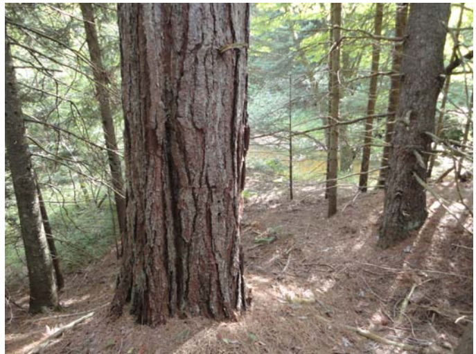
Restorable dry-mesic northern forest, Newberry Compartment 35.