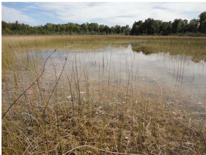
Emergent marsh, Misery Bay (North Pointe_Rockport).

Surveys focused on wetlands on State Forest land. Documented high-quality northern wet meadow and emergent marsh.