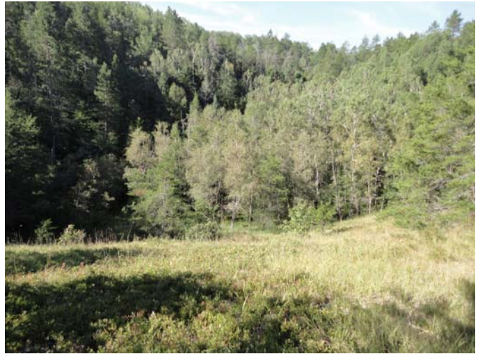
Sinkhole, The Sinkholes.