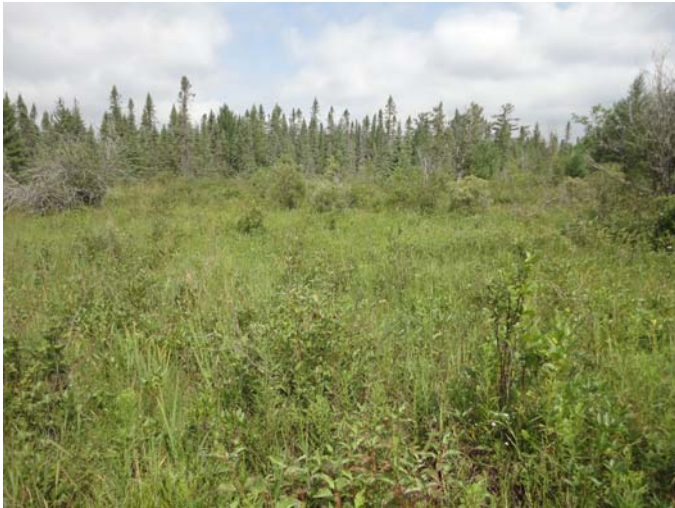
Poor fen, Hartwick Pines.