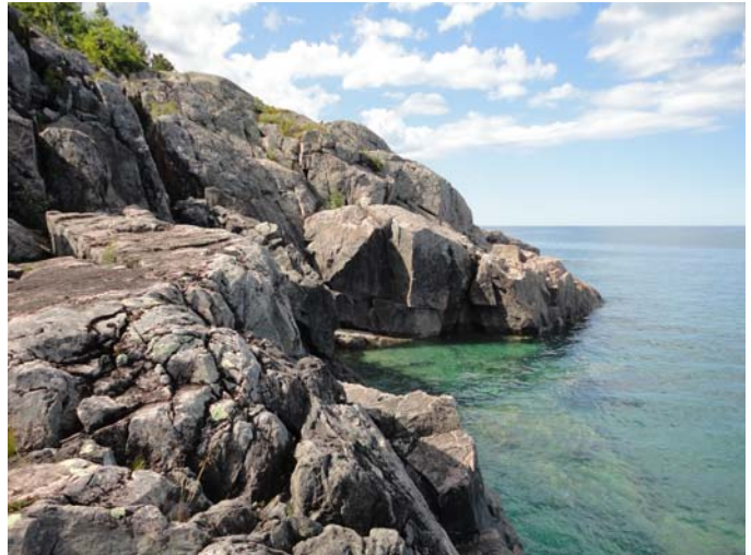
Granite lakeshore cliff, Little Presque Isle Complex.