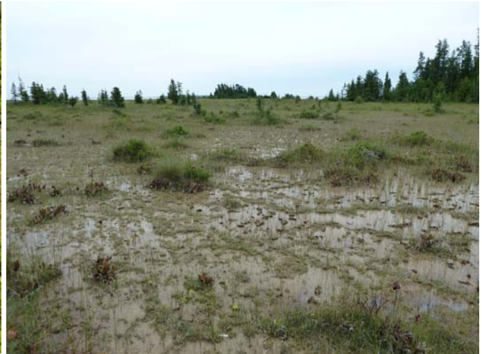
Coastal fen, St. Ignace Complex.