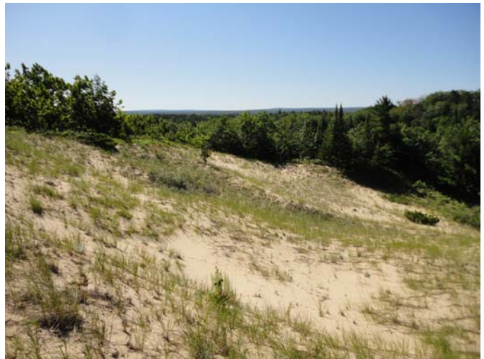
Open dunes blowout, Wilderness State Park_Wycamp Complex.