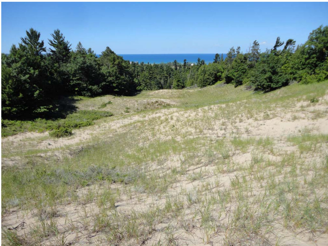
Open dunes blowout, Wilderness State Park_Wycamp Complex.