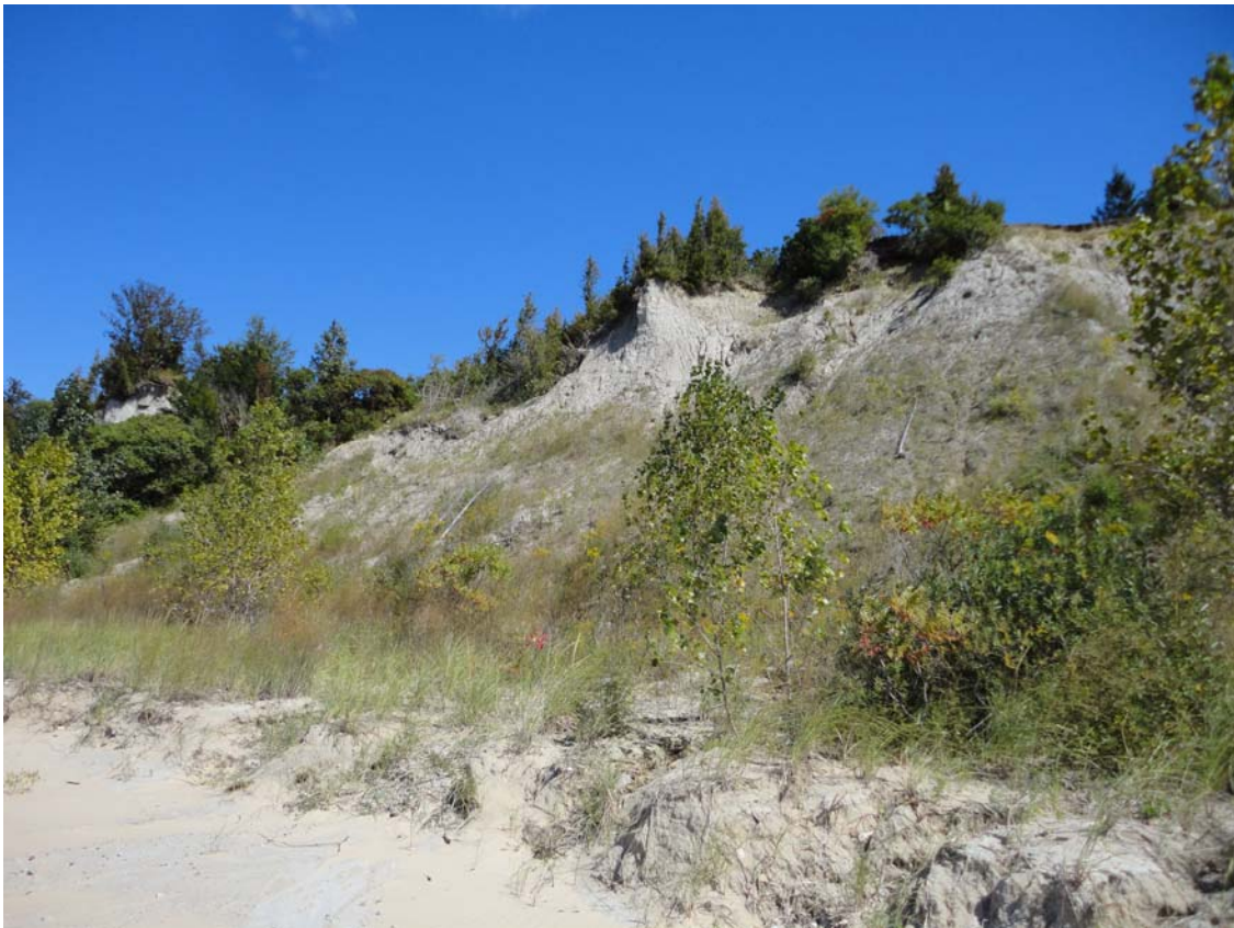
Clay seepage bluffs from Lake Mich - Poly 19 (above) and Wau-Ke-Na.