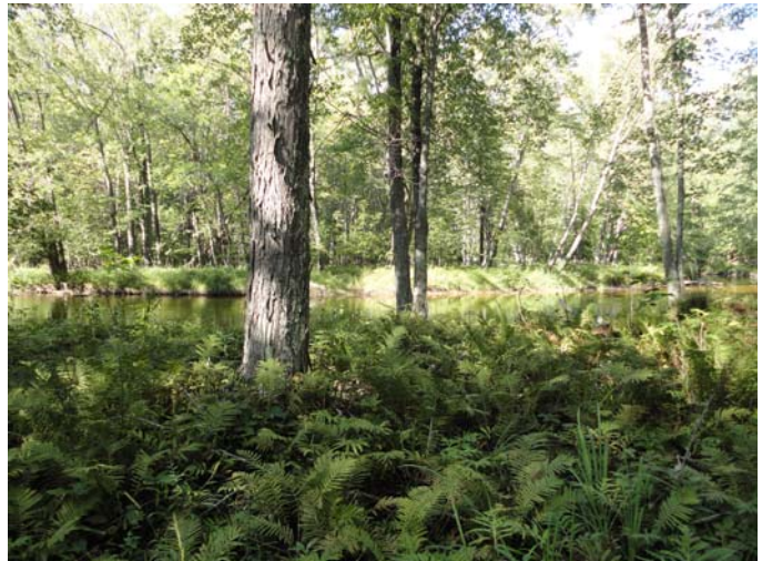
Floodplain forest, Black River NFW (Photo by Joshua Cohen).