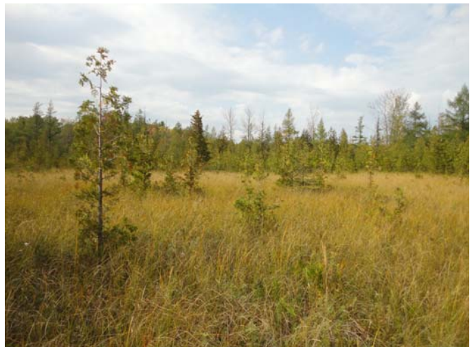
Northern fen, Devil's Lake (Photo by Joshua Cohen).