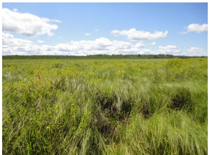
Northern wet meadow, Tomahawk NFW