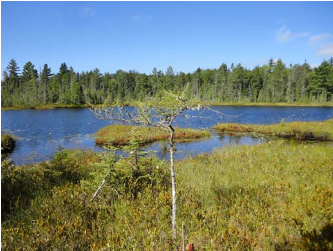
Bog, Newberry Compartment 35 (Photo by Joshua Cohen).

Conducted surveys to evaluate peatlands. Documented high-quality muskeg, bog, poor fen, and northern shrub thicket.