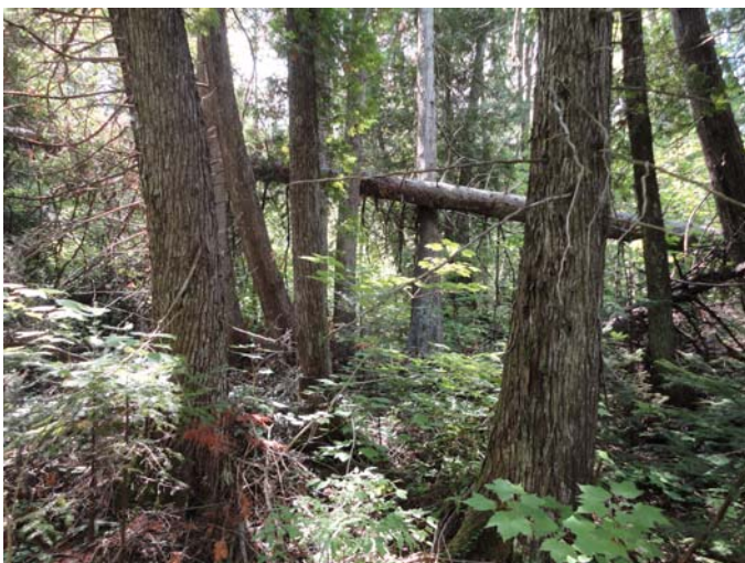
Rich conifer swamp, Noble Lake Forested Wetland Complex (Photo by Joshua Cohen).

Conducted surveys to evaluate wetlands associated with Noble Lake. Documented high-quality rich conifer swamp and mesic northern forest. Also documented additional acreage of high-quality rich conifer swamp to incorporate into existing element occurrence.