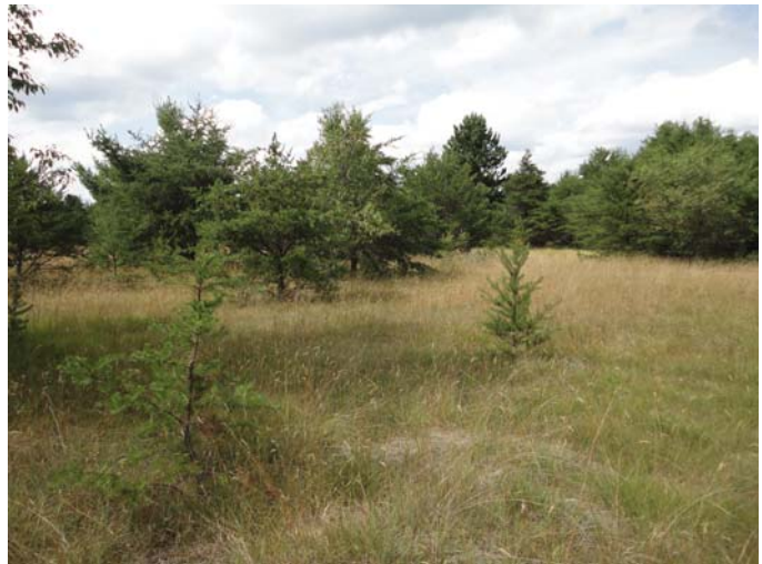
Pine barrens, Grayling Compartment 227 (Photo by Joshua Cohen).