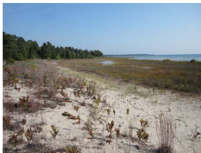
Open dunes, Rockport (North Pointe_Rockport).