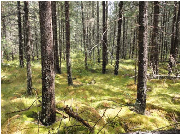
Poor conifer swamp, Cranberry Bog Complex.