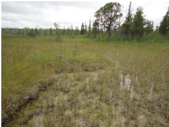
Prairie fen, Proud Lake SRA (Photo by Joshua Cohen).

Surveys were conducted to re-evaluate the southern wet meadow and wetlands associated with Proud Lake as part of a contract with PRD. Documented high-quality prairie fen within wetland complex.