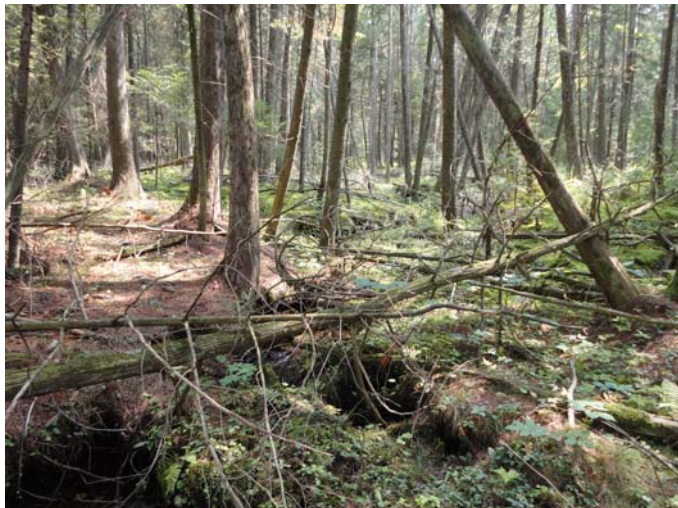
Rich conifer swamp, Wolf Creek and Grass Lake (Photo by Joshua Cohen).

Surveys focused on wetlands along Townline Creek on State Forest land. Documented high-quality rich conifer swamp and northern wet meadow.