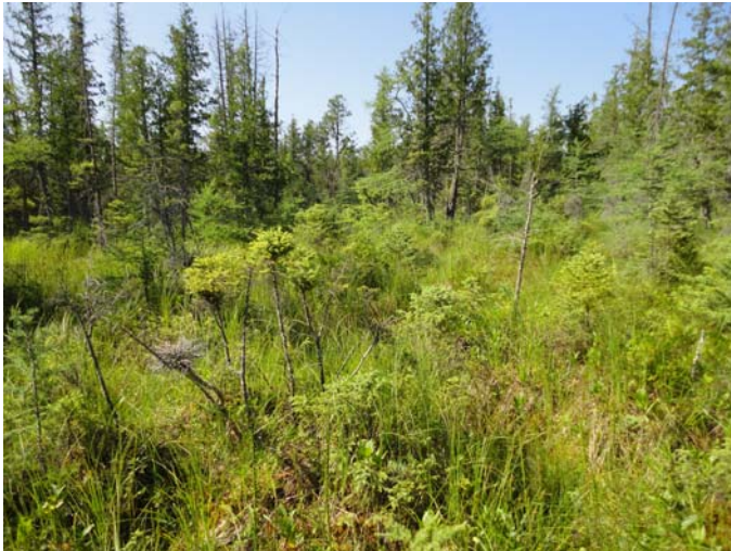
Northern fen, Grayling Compartment 207.