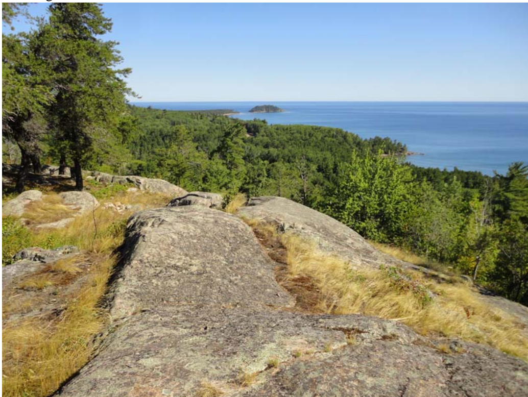
Granite bedrock glade, Little Presque Isle Complex.

Surveys focused on granitic features and shoreline on State Forest land. Documented high-quality granite bedrock glade, granite cliff, granite lakeshore cliff, granite bedrock lakeshore, dry-mesic northern forest, sandstone lakeshore cliff, and granite cobble shore.