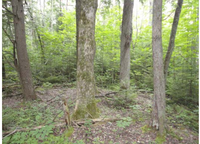
Hardwood-conifer swamp, Grass Lake.