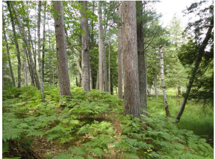
Dry-mesic northern forest, Grayling Compartment 207.