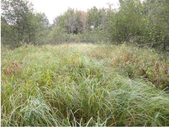
Northern wet meadow, Cedar Lake NFW.

Surveys focused on wetlands associated with Coppler Creek on State Forest land. Documented high-quality northern wet meadow and northern shrub thicket. In passing, noted high-quality poor conifer swamp.