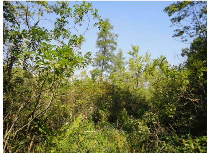
Rich tamarack swamp, Island Lake SRA (Photo by Joshua Cohen).