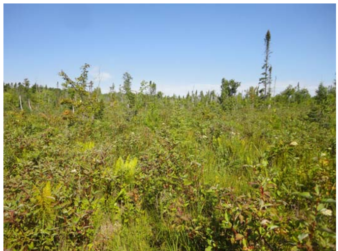
Poor fen, Tahquamenon Falls State Park.