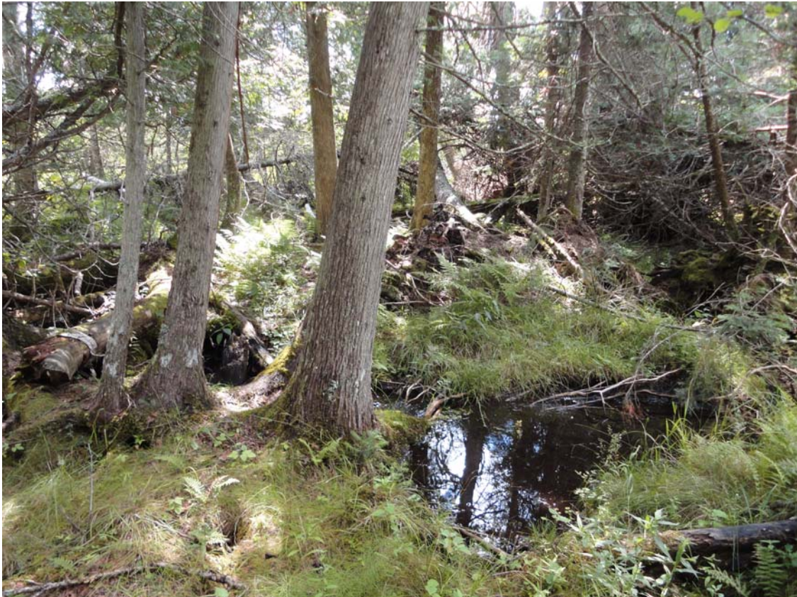
Rich conifer swamp (above) and northern wet meadow (below), Bates Lake NFW (Photos by Joshua Cohen).