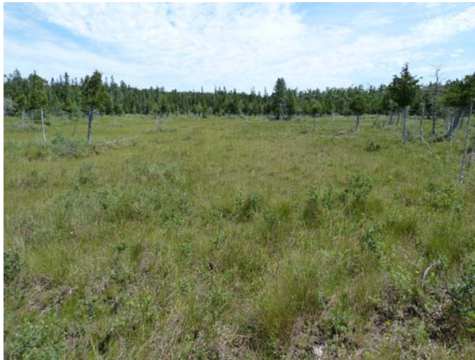
Northern fen, Quarry Site.

Conducted surveys focused on peatlands. Documented high-quality northern fen.