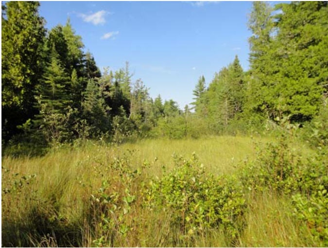
Wooded dune and swale complex, Seiner's Knob Complex.