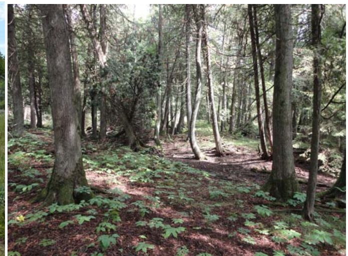
Boreal forest, Wells State Park.