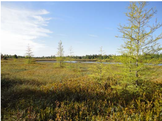
Poor fen, Chub Lake Swamp (Photo by Joshua Cohen).

Conducted two days of surveys on State Forest lands. First day of surveys focused on wetlands and uplands associated with Mud Lake and second day of surveys focused on shoreline and near shore areas. Documented high-quality Great Lakes marsh, interdunal wetland, northern fen (two separate occurrences), intermittent wetland, and dry-mesic northern forest.