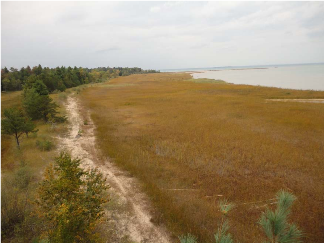
Great Lakes marsh, Devil's Lake (above) and limestone cobble shore, Rockport (North Pointe_Rockport) (below).