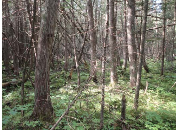
Rich conifer swamp, Ogemaw Swamp.